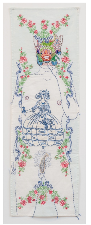
"Inner Child" 34 x 11 inches, hand-stitched embroidery on fabric