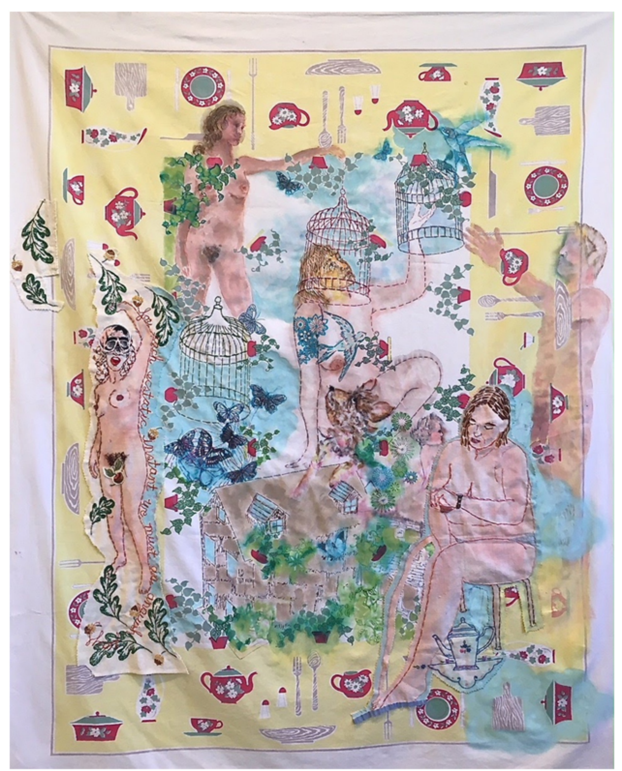
"Caged Beauty" 50 x 63 inches, hand-stitched embroidery, applique and paint on hand-printed table linen