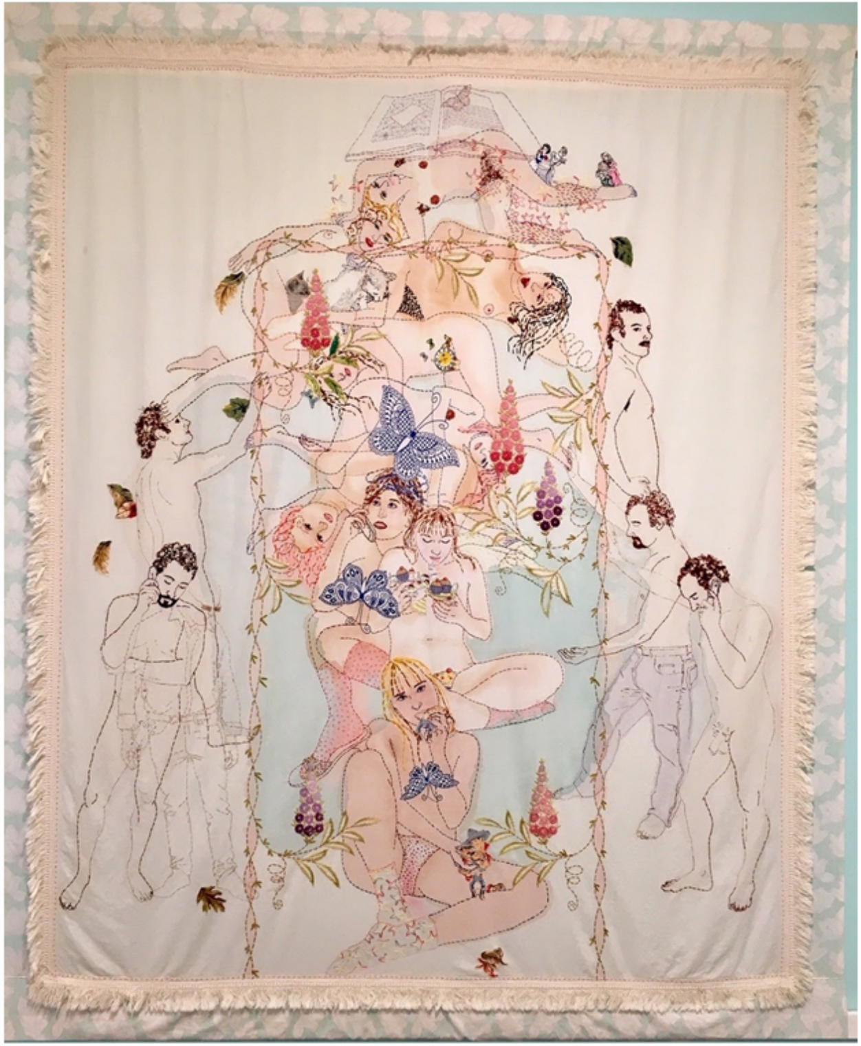
"Sugar and Spice and Everything Nice" 95 x 80 inches, hand-stitched embroidery and paint on vintage bed linen