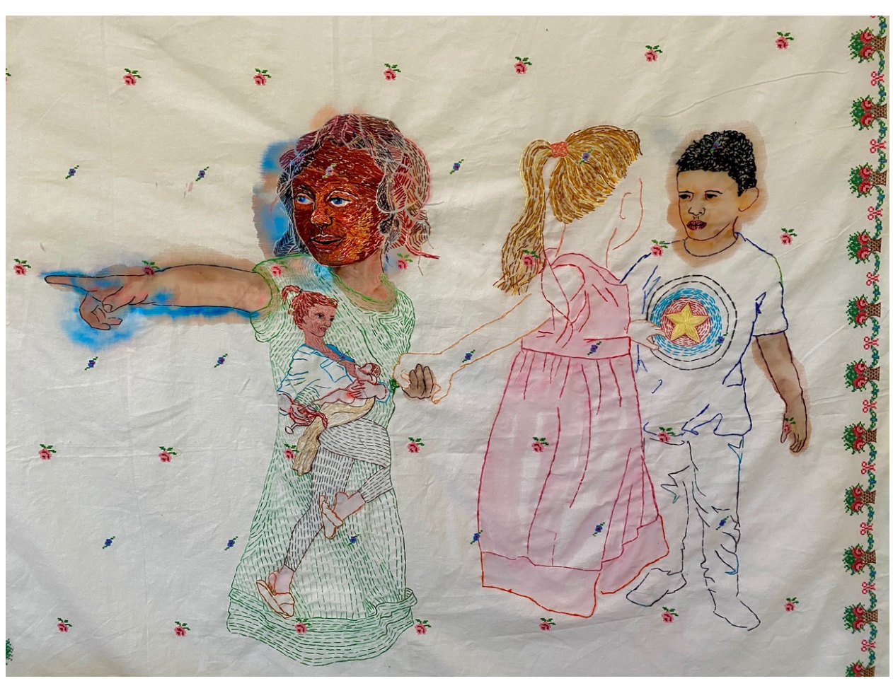
"Kids" 48 x 55 inches, embroidery and paint on vintage table linen