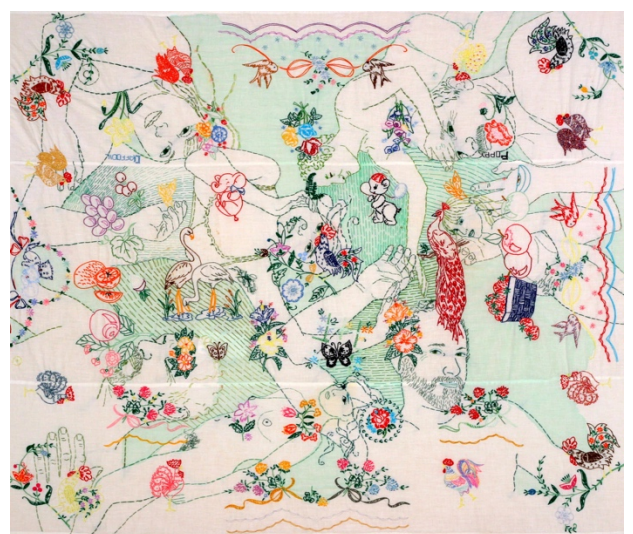
"Green Haze" 40 x 46 inches, hand-stitched embroidery and paint on fabric