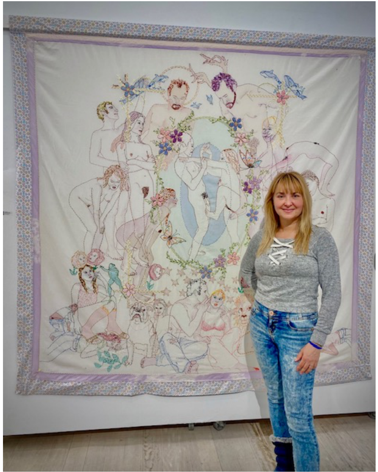
• Posted in Art Department News on May. 17, 2021