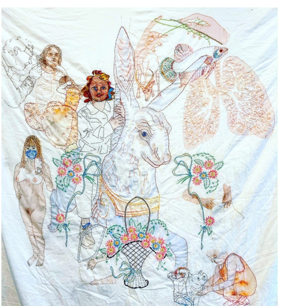
"When Fish Fly" 80 x 60 inches, hand-stitched embroidery on fabric