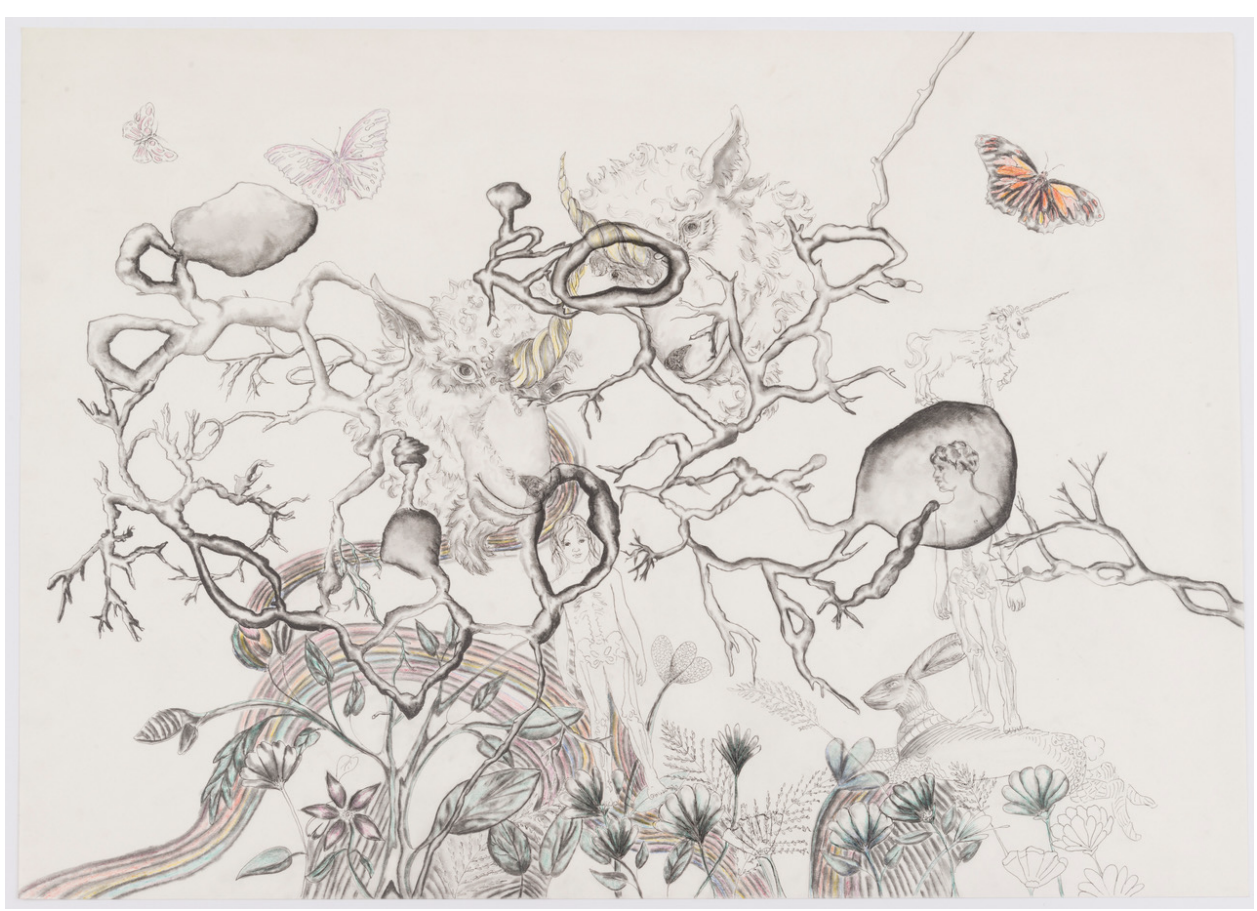
"Rainbow's End" 28 x 22 inches, pencil on paper